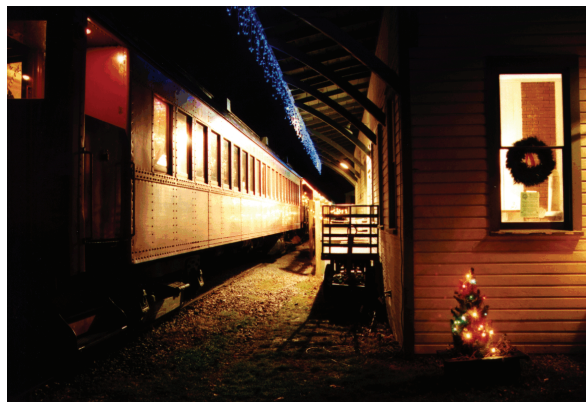
Christmas at the Milford Depot