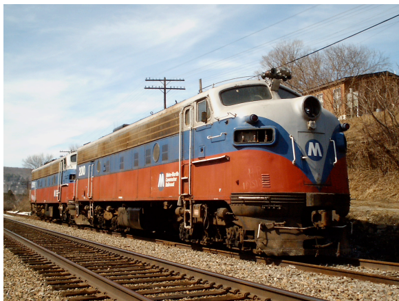
LRHS's two FL9 Locomotives shortly after being delivered to Cooperstown Junction